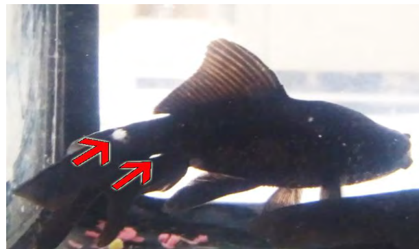
Fig.1. White spots disease infection in a Goldfish ( Carassius auratus ), Note the mass of large, white cotton on the fish's body surfaces