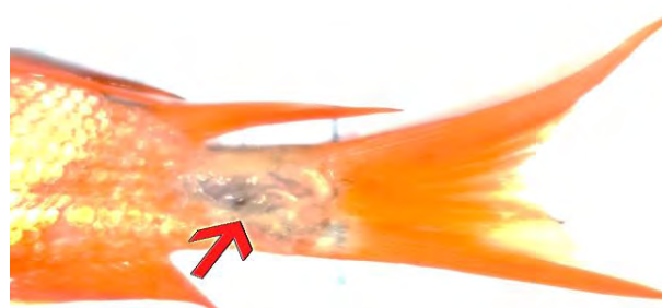
Fig. 2. Koi ( Cyprinus rubrofuscus ) infected by Saprolegnia, Note the granular