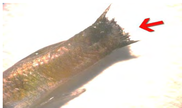
Fig. 4. Erosion of the caudal fin in guppy ( Poecilia reticulata ), note erosion of the caudal fin