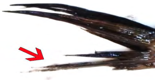
Fig. 5. Erosion of the caudal fins until tail completely rotten in Koi ( Cyprinus rubrofasciatus )