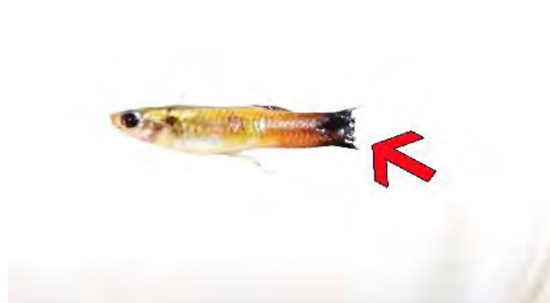
Fig. 3. Erosion of the caudal fin in guppy ( Poecilia reticulata ), note erosion of the caudal fin